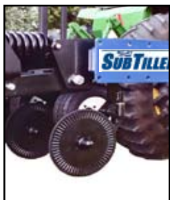
Super 1200 Flex Coupler mounted on SubTiller 4