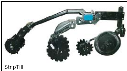
Super 1200 Flex Coupler with Rigid Mount, Residue Manager, SealPro II, sealer and Torsion Basket