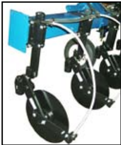
Jet Stream liquid injection assembly with Super 1200 Flex Coupler