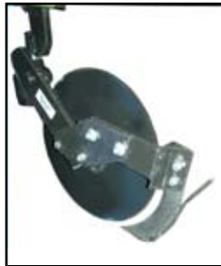
Super 1200 Flex Coupler with attached liquid knife