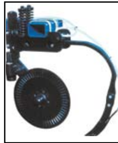
SCS spring cushion mount with Super 1200 Flex Coupler